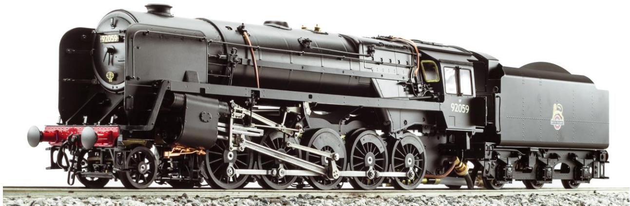
All images are of the Engineering Sample

The British Railways BR Standard Class 9F 2-10-0 was designed for British Railways by Robert Riddles for use on fast, heavy freight trains over long distances. The total number built was 251. The last of the class, 92220 'Evening Star', was the final steam locomotive to be built by British Railways, in 1960. Withdrawals began in 1964, with the final locomotives removed from service in 1968. Several examples have survived into the preservation.